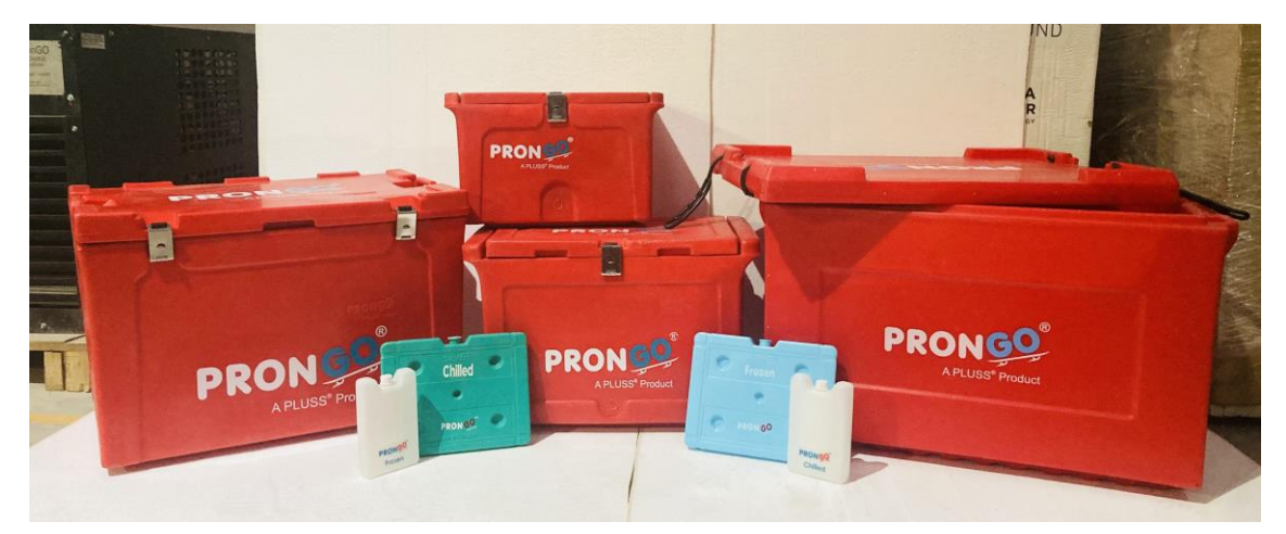
Figure 1: 25L, 50L, 100L and 150L rotomoulded boxes with HDPE thermoTab bottles