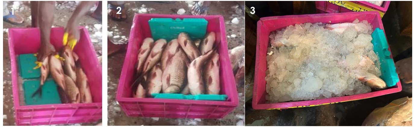
Figure 2: thermoTab 1200 along with Ice used in 75 Litres crate for fish shipping