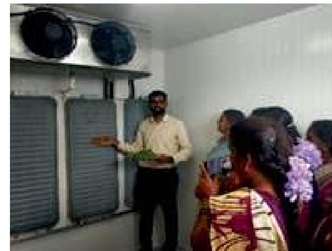
Electrical battery free: Installed PCM plates act as thermal batteries.