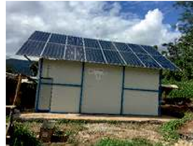
5 MT PCM based cold room (3 MT and other customized solutions also available).