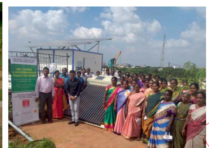
Increases farmer's income and encourages entrepreneurship.