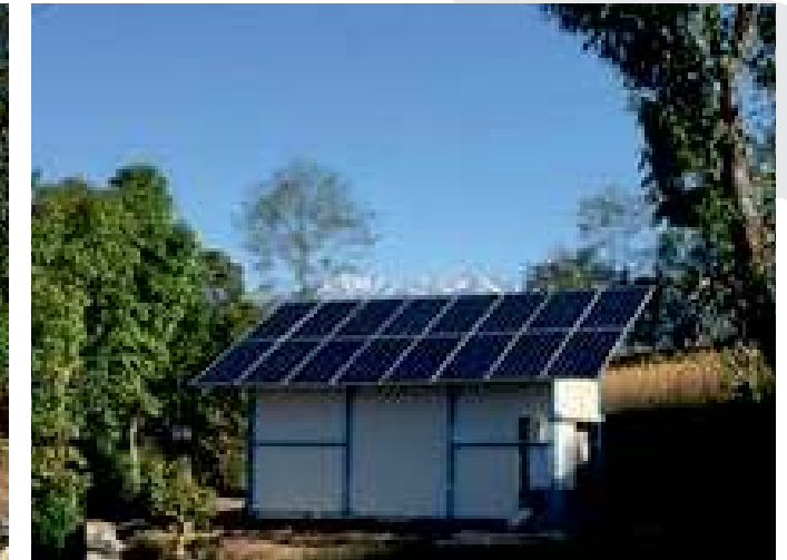
100% grid and diesel free: Powered by solar energy; net-zero carbon footprint.