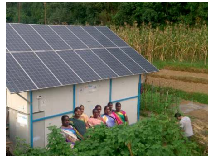
High quality produce: HimaCool™ functioning as farm gate for farmers.