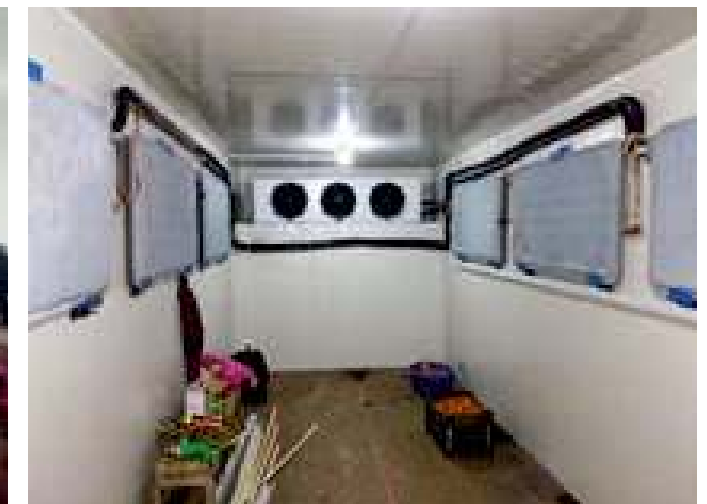
Frozen Temp. range: -15 to -25 °C. Chilled Temp. range: +2 to +8 °C.